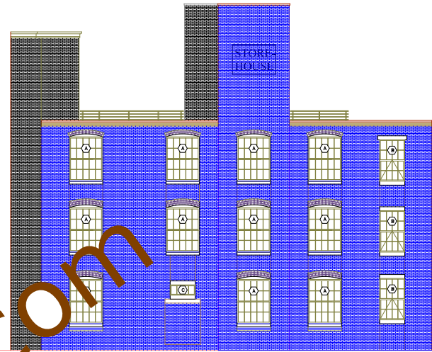
8 PROPOSED REAR ELEVATION SCALE: 1/8" = 1'-0"